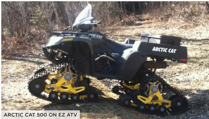
ARCTIC CAT 500 ON EZ ATV

MODELS IN SERIES: EZ ATV, EZ UTV, EZ MAXIM, EZ HD