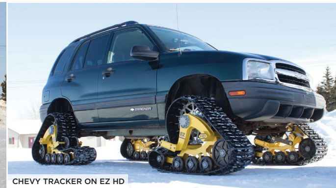
CHEVY TRACKER ON EZ HD