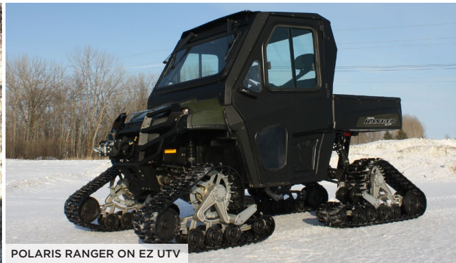
POLARIS RANGER ON EZ UTV