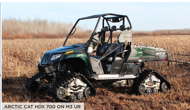
ARCTIC CAT HDX 700 ON M3 UR