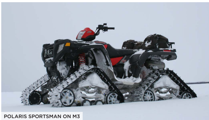
POLARIS SPORTSMAN ON M3

MODELS IN SERIES: M3, M3 UR, M3 UR HD - Plus and 6x6 available on each